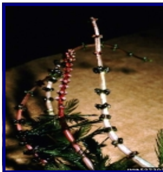
Small flowers borne on leafless, reddish spikes, which stand a few inches above water, submerge after pollination.