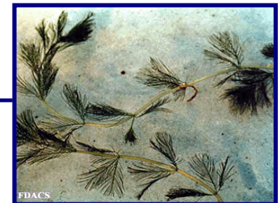
Leaves in comb-like clusters or whorls of 3 to 4.