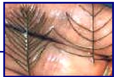
Non-native Eurasian watermilfoil on the left, native Milfoil on the right.