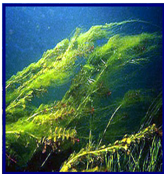
Much of the spread in the U.S. is due to boating movement.

Eurasian watermilfoil reproduces mainly by floating plant fragments produced by waves and boaters, which are then spread by water currents making the plant difficult to contain. New plants develop when the fragments sink to