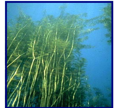
Milfoil grows rooted in water from 1 to 33 feet deep, regularly reaching the surface while growing in water 10 to 17 feet deep, and can survive under ice.