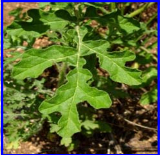
Buffalobur leaves are deeply lobed, resembling a watermelon leaf.