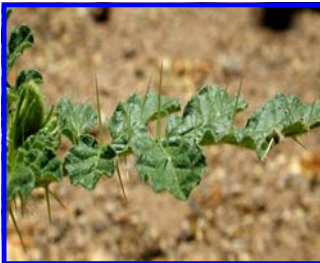
Close-up of leaves covered with long stiff yellow prickles.

Buffalobur is drought tolerant and can be found in meadows, dry rangeland, pastures, lawns, cultivated fields, roadsides, and waste areas and survives in disturbed, dry areas. It can grow in a wide variety of environmental conditions and serves as a host for the Colorado potato beetle. A single plant can produce 8,500 seeds.