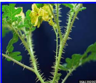
The stout spines are sharp, and covered with a substance that can cause intense, lingering pain in anyone stabbed by them.

summer and into the fall. The stems, leaves, and even flowers sport many sharp spines. Leaves are deeply lobed and grow up to 5 inches long. Yellow flowers are one inch across with five petals. A dry berry covered with sharp spines contains numerous black, wrinkled and flattened seeds. Seeds mature shortly after flowering. It has fibrous roots with erect heavily branched stems. Mature plants grow 1 to 2 feet tall and are covered by straight yellow spines.