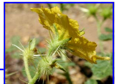
Flowers have five yellow petals that are fused, giving the appearance of being a solid skirt with irregular margins.