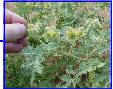
Close-up of bur fruiting structure covered with long stiff yellow prickles.

This noxious weed may be found as a contaminant in birdseed. These plants often break off at the soil and tumble in the wind, scattering seed. It can be found in some row crops, however, it is not a great competitor. The burs may cause damage and considerable loss in wool and fiber value for sheep and goats. The stiff spines of this weed can cause injury as well as contain alkaloids that can be poisonous to livestock.