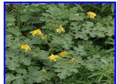
Occasionally been found under bird feeders and in gardens here in Lincoln County. All have been quickly eradicated.

Since Buffalobur can self-fertilize, a single plant can start an infestation. It flowers throughout the