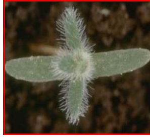
Close-up of a Kochia seedling