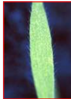
Close-up of kochia leaf

Kochia has shown resistance to two groups of herbicides, the sulfonylureas and triazines. This has been well documented in the U.S. and Canada. Herbicide resistance is one of the reasons why kochia was quickly targeted for eradication. Rotating herbicides would reduce the possibility of an increase in the proportion of plants tolerant to herbicides. Triazine resistant biotypes are more susceptible to 2,4-D ester than triazine susceptible biotypes.