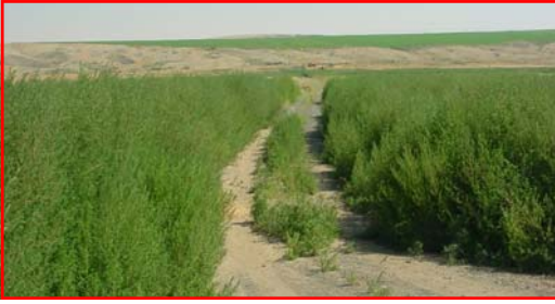
A Kochia infestation in southern Lincoln County. This healthy stand grew up to 7 feet tall. One kochia plant typically produces 14,600 seeds.