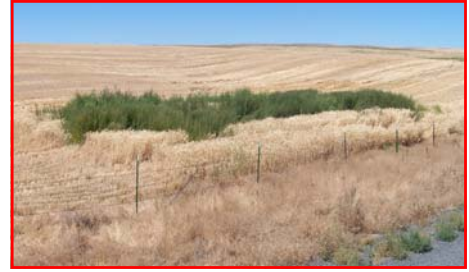
This Lincoln County farmer harvested around his patch of kochia.