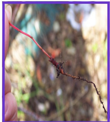
This root fragment can extend 60 feet from the parent plant and seven feet below the soil.