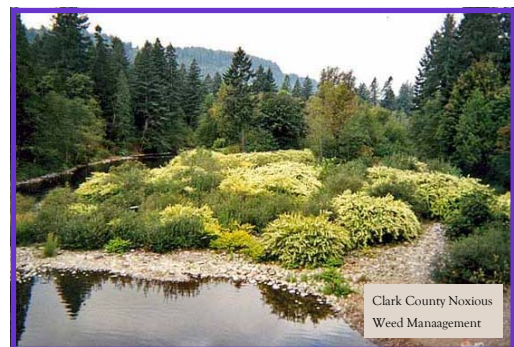
Once in bloom, Japanese knotweed should stand out showing its aggressive habits.

Photos and information courtesy of: University of Weed Science, USDA Plants Database, InterHealth, EFG Biodiversity Image Gallery, Clark Co. Noxious Weed Management, Thurston Co. Noxious Weed Control and Washington State Noxious Weed Control Board.