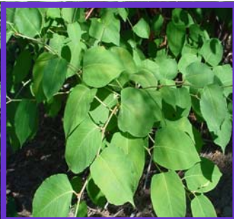
Leaves of the Japanese knotweed can be 6-inches long.