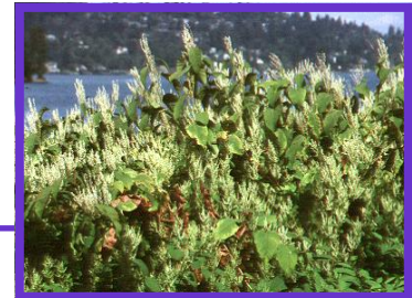
Japanese knotweed can grow up to 10 feet tall.