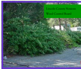
Shady, moist areas are where Japanese knotweed grows best; photos are along Lake Roosevelt, in Lincoln County.