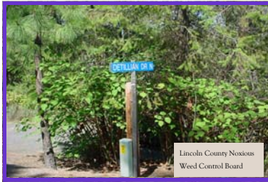
Japanese knotweed hiding amongst trees.