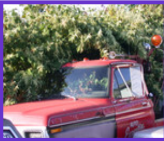
Watch out! Japanese Knotweed grows quickly. It can spread and over take vehicles.

upon environmental conditions. Japanese Knotweed spread mainly by rhizomes and stem fragments;