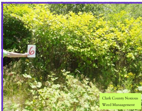
Japanese knotweed infestation before injection treatment.