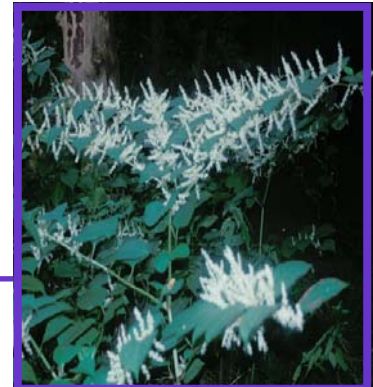
Japanese knotweed rarely establishes colonies by seed.