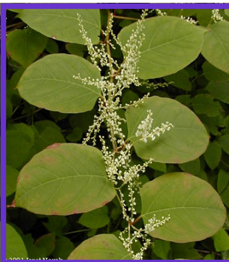
Flowers of the Japanese Knotweed are minute, and greenish-white. Its seeds have low viability.