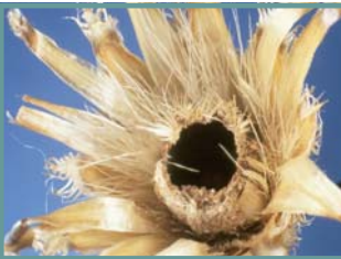
Hollowed out seed head from exiting adults.

Larinus minutus is one of the biggest bio success stories for Lincoln County Washington.