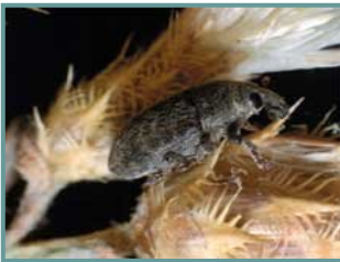
Adult Larinus minutus .